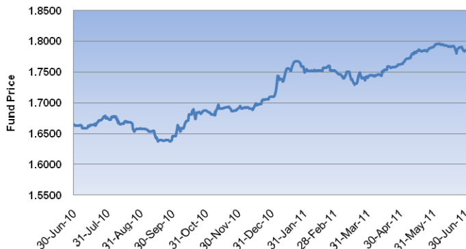
RSA Fund Price from 30 June 2010 to 30 June 2011

The Stanbic IBTC RSA Fund ("The Fund") which opened on 02 May 2006 at N1.0000 closed at N1.7857 as at 30 June 2011. In line with investment guidelines issued by PenCom, the Fund's portfolio allocation was as follows on 30 June 2011: Government Securities ( 62.77% ), Money Market ( 15.13% ), Quoted Equities ( 20.93% ), and Other Fixed Income ( 1.17% ).